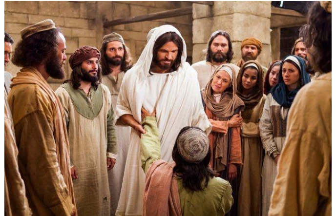
Jesus proclaimed the Gospel of the kingdom and cured every disease among the people.

Twenty-Third Sunday in Ordinary Time September 5, 2021