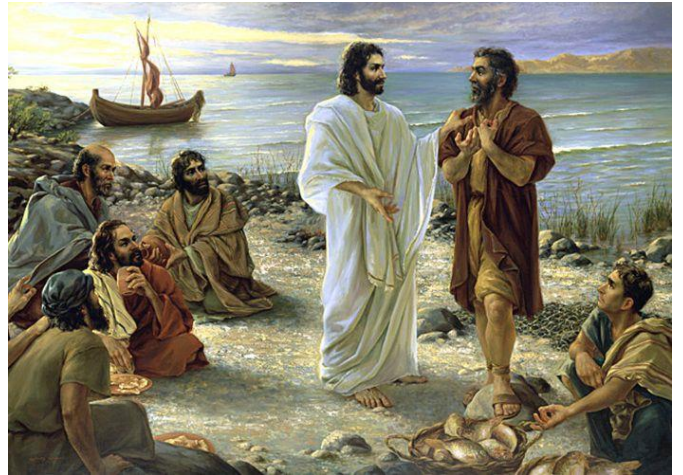
"Who do people say that I am?"

Twenty-Fourth Sunday in Ordinary Time September 12, 2021