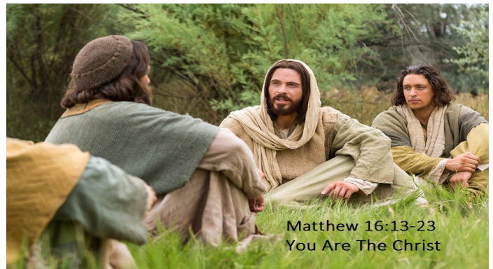
Matthew 16:13-23 You Are The Christ